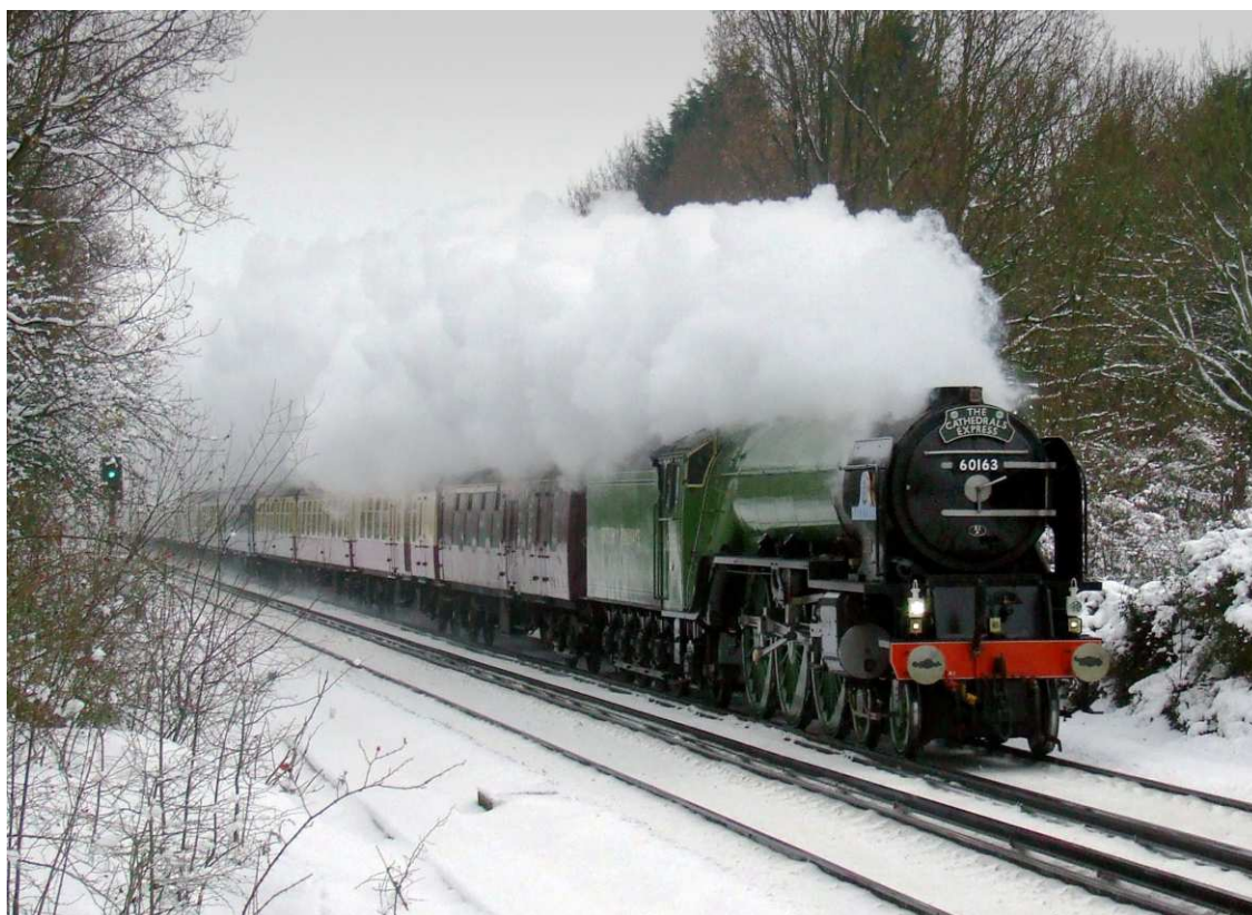
No. 60163 Tornado hauling 'The Cathedrals Express'

Tornado , the first new main line steam locomotive to be built in Britain for almost 50 years, defied the arctic weather on Monday 21st December 2009 and hauled two of only a handful of trains operating in Kent. The new Peppercorn class A1 pacific's 1940s technology was able to withstand the snow and ice