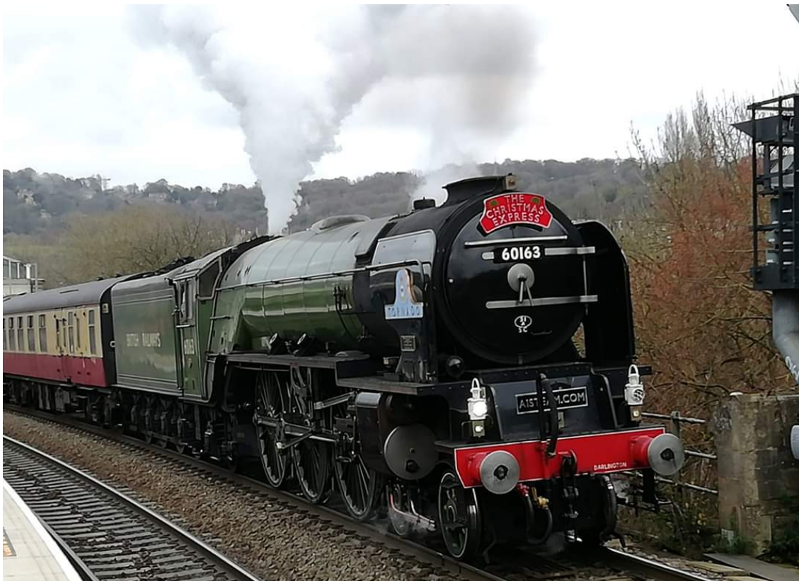
No. 60163 Tornado, hauling the 'The Christmas Express'

Tornado is now entering her second decade; we invite you to join her on a nostalgic journey to a wide range of destinations over the next year. Our Tornado Spring and Summer Rail Journeys 2020 brochure is now available.